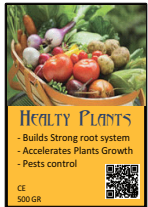
Horticulture, Fruits & Plants