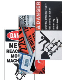
Machinery & Facilities

The new advanced ink and print-head technology empowers the VP495 to deliver crisp text and high-definition graphics at a print resolution as high as 1200 x 1200 dpi – unmatched by any known pigment ink based solution of its class in the market today!