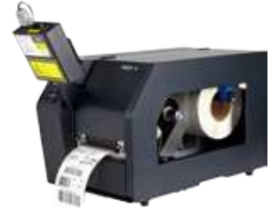
Online Data Validator (ODV)