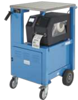
Powered Mobile Print Cart